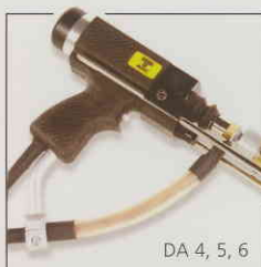
DA 4, 5, 6