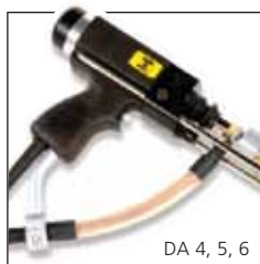
DA 4, 5, 6